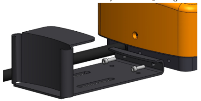
It can be installed independently on the wall

It can be installed directly on the RDC Charger