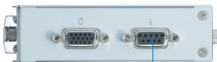
1 x DI/DO (8-bit programmable)