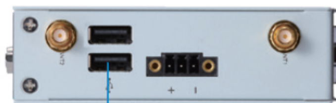
2 x USB